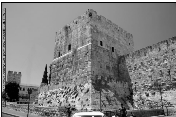
Walk about Zion, go all around it, count its towers. Psalm 48:12