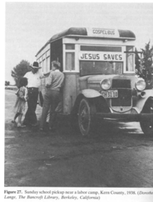
Figure 27. Sunday school pickup near a labor camp, Kern County, 1938.