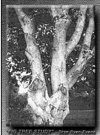
FIG TREE STUDY - Sky Eye-View http://rusticmooncrafts.homestead.com/files/digital_painting_fig_tree_study_web.jpg

"Look at the fig tree and all the trees; 30 as soon as they sprout leaves you can see for yourselves and know that summer is already near.